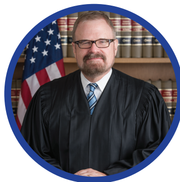
Hon. Michael Fitzgerald United States District Court Central District of California